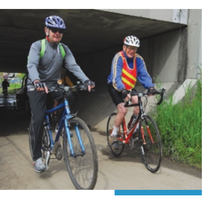
Bond funds will add more than six miles to THPRD's trails network, benefiting walkers, runners and bicyclists.