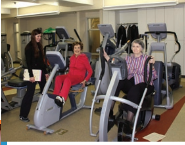
Stuhr Center patrons "55 and better" are already enjoying the new fitness room and equipment.

The Facility Expansion and Improvement project group includes $8,300,000 for improvements at existing facilities. There are five projects in the category, of which three (the smaller ones) have been completed.