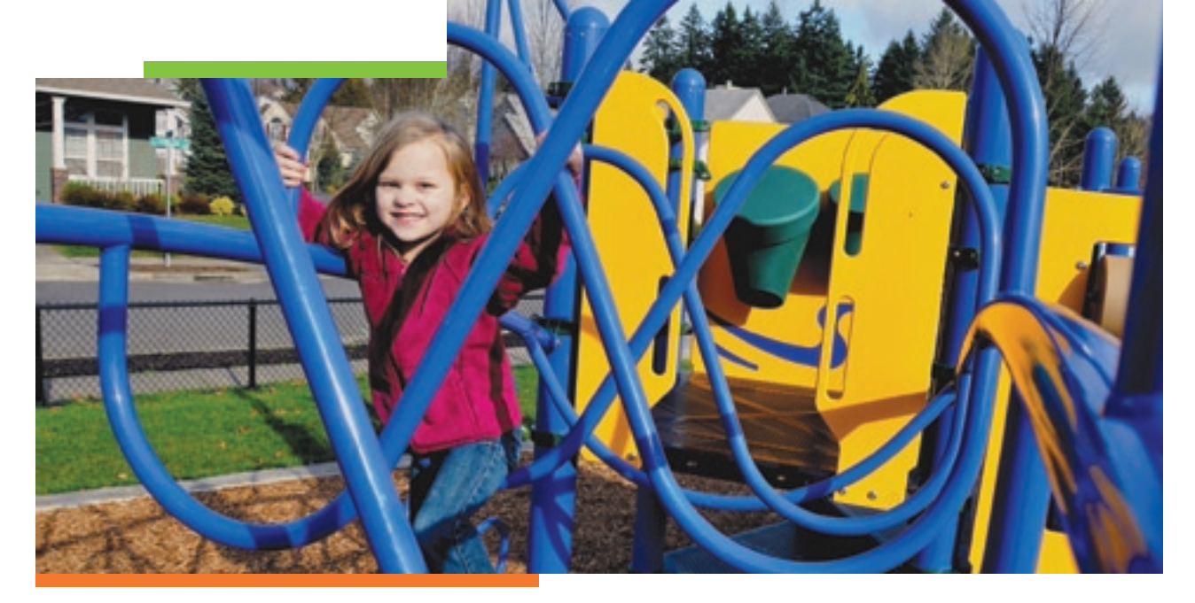
Just ask the children: A popular amenity of any neighborhood park development or redevelopment is new play equipment.