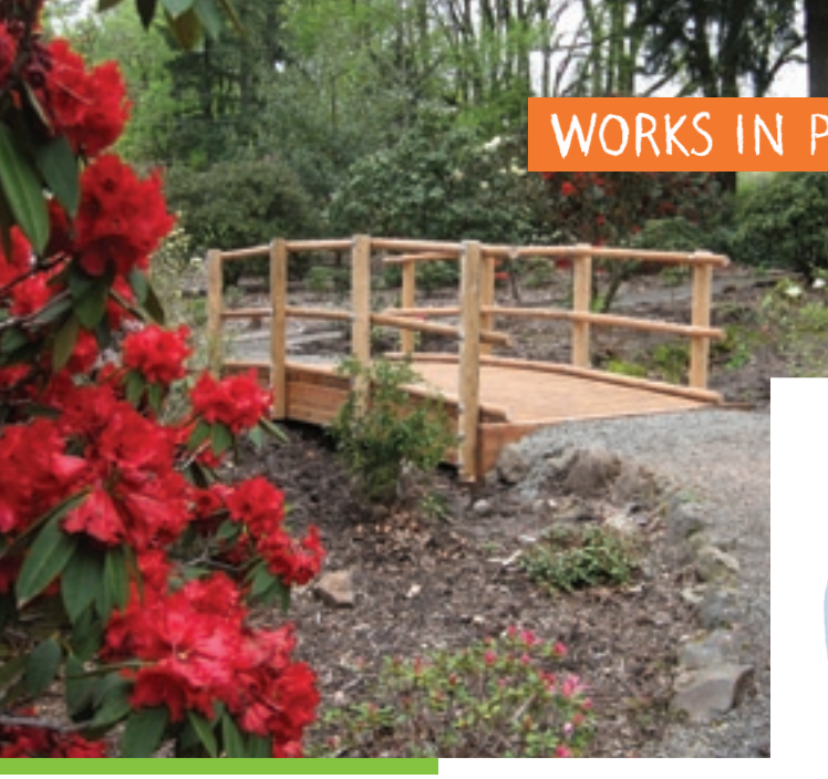
This new bridge at Jenkins Estate is one of many maintenance replacements funded by the Bond Measure.