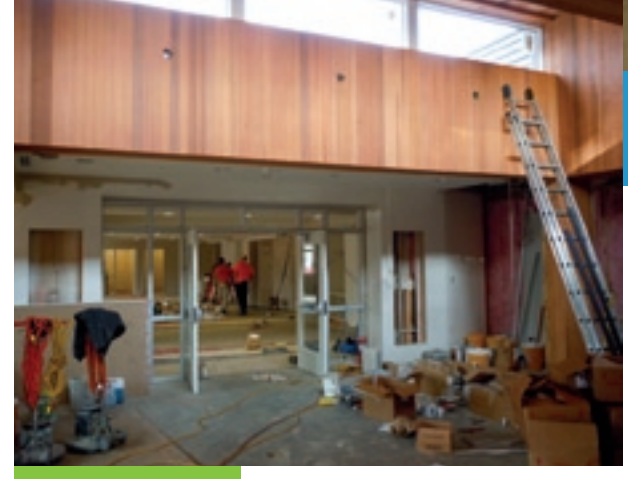
Renovation and expansion of the Elsie Stuhr Center will be completed in the spring of 2012.

Eight of the projects were in the construction document stage as of June 30, 2011, and the project category was overall under budget by $218,000. As bids are received and bid awards made from the projects in the construction document phase, updates to expected costs as well as budget over/under funding will occur. Many of these projects at each site are collections of separable tasks so that depending on the bids, the project scope can be adjusted to keep the category within overall dollar allotment.