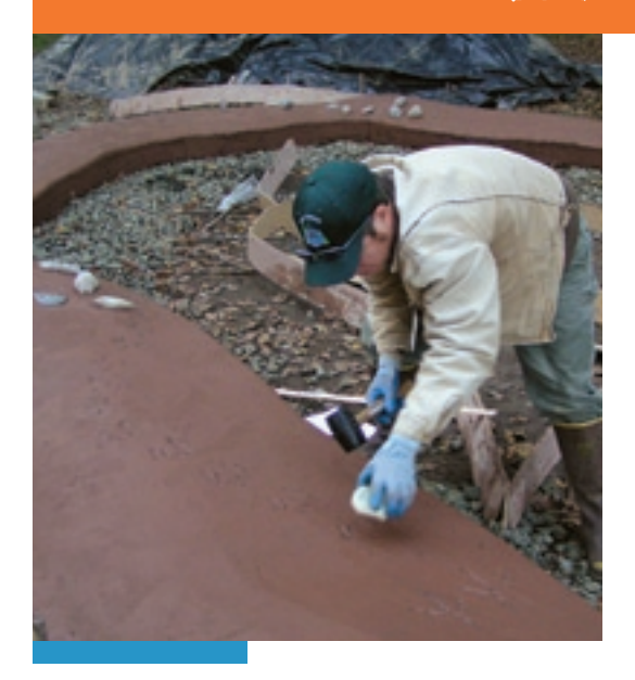
All bond project work is carefully managed in accordance with priorities set by the THPRD Board of Directors.

During 2009 and 2010, the THPRD Board and staff engaged in intensive planning and structuring of Bond Measure projects, establishing priorities and developing financial and operational principles to guide the staffing, contracting and public communications needed to accomplish bond objectives.