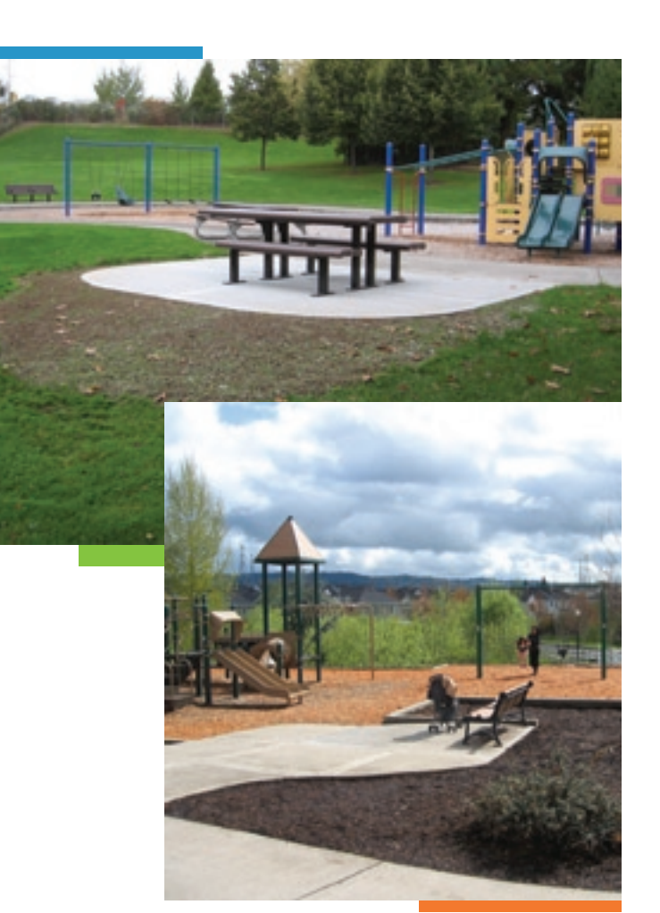
Improving ADA access has been a priority for THPRD at play equipment installations and other sites around the district.