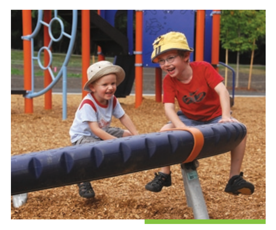
New play equipment at Lost Park in the Cedar Mill area spells f-u-n for two youngsters.

Play is the only way the highest intelligence of humankind can unfold." JOSEPH CHILTON PEARCE